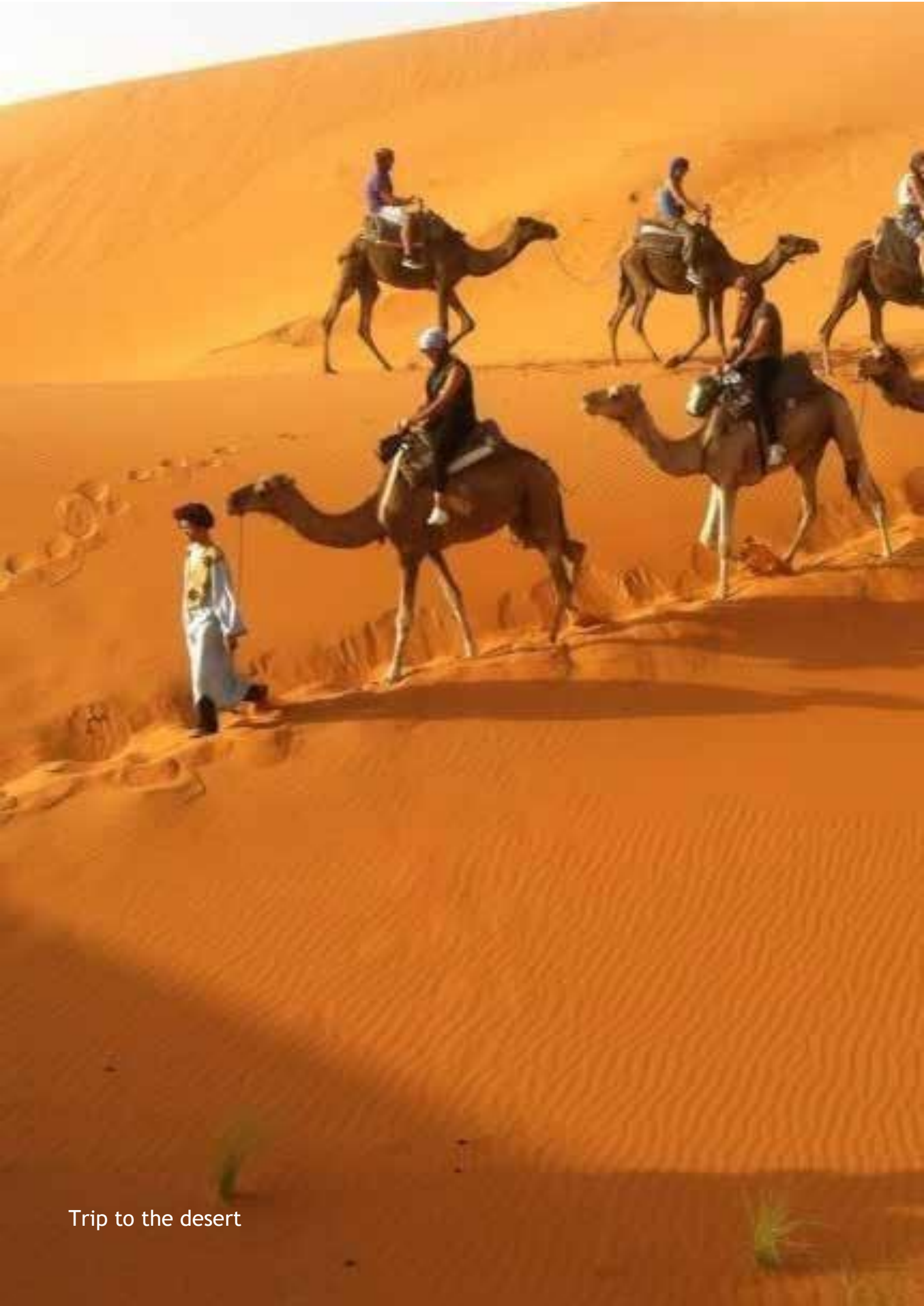
Trip to the desert