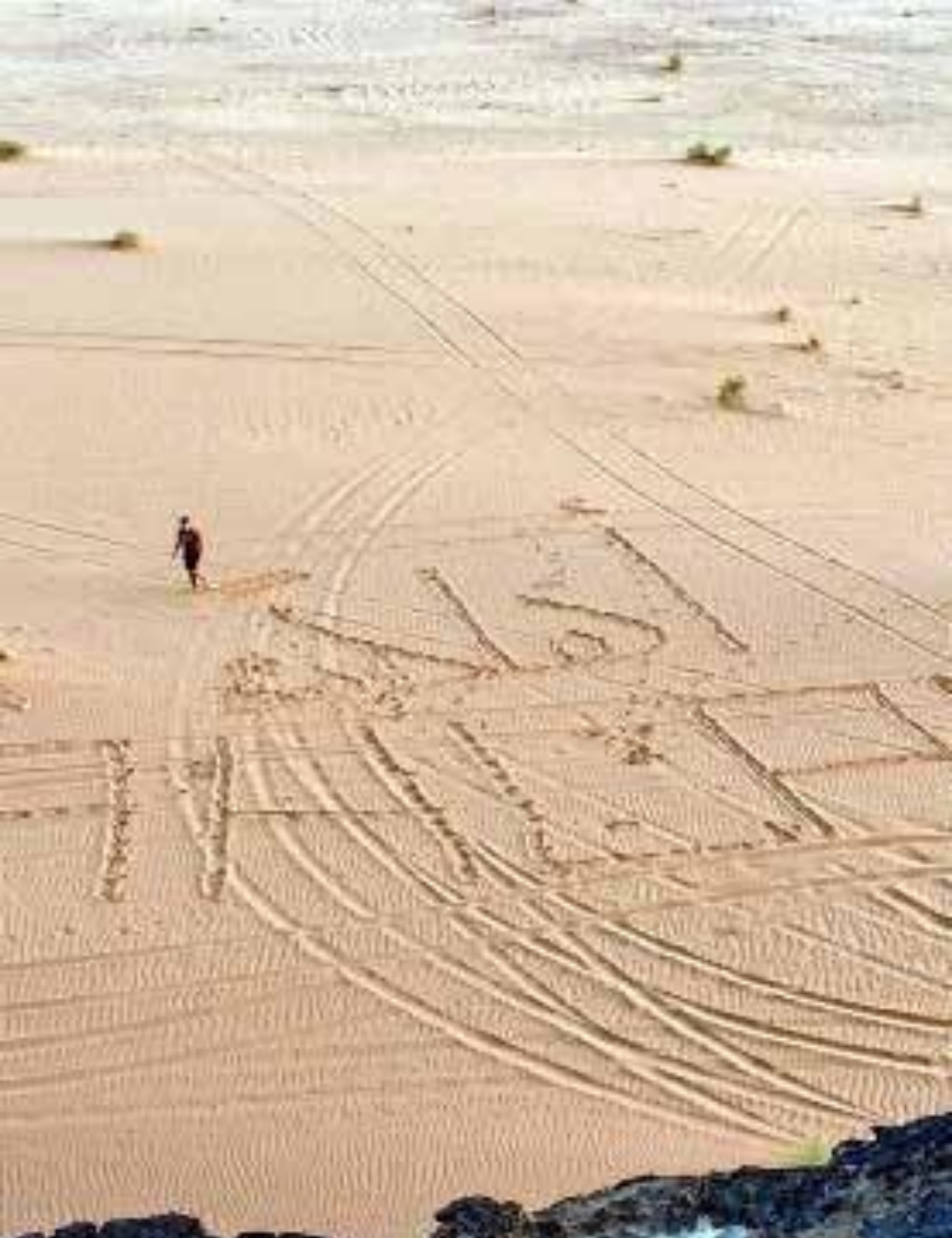
Ahlan leaving its mark even in the desert!