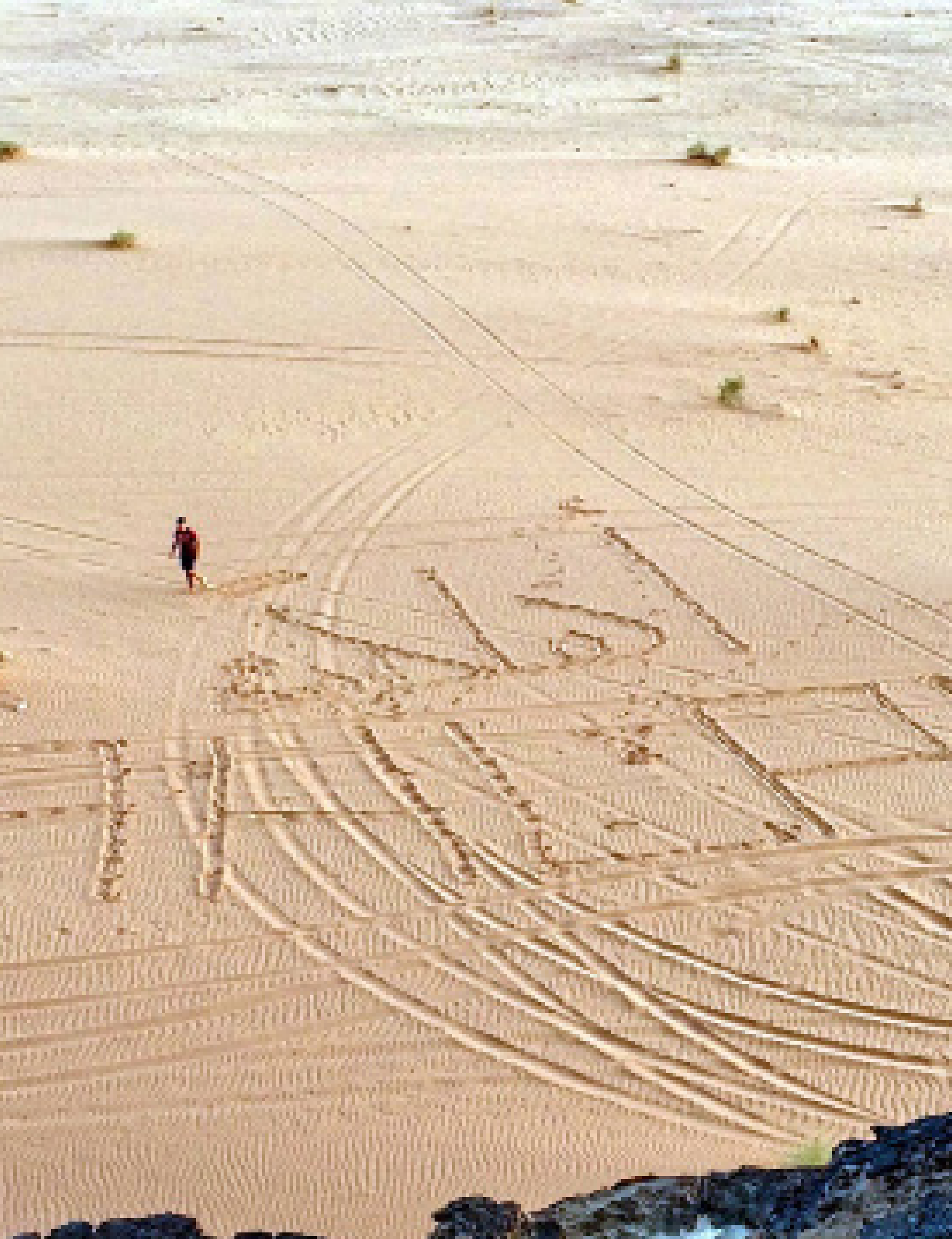
Ahlan leaving its mark even in the desert!